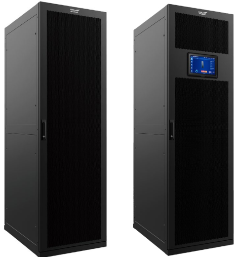
No screen version touch screen version

Wisemdc Wise Cabinet Mini Data center solution is Intelligent network equipment dedicated integration cabinet solution,integrated of special solution, The modular design integrates power supply and distribution, cabinets, and monitoring systems with a single cabinet as the carrier. It saves room space and can be flexibly expanded. Each unit component of the system is prefabricated and debugged in the factory to achieve rapid deployment on site.